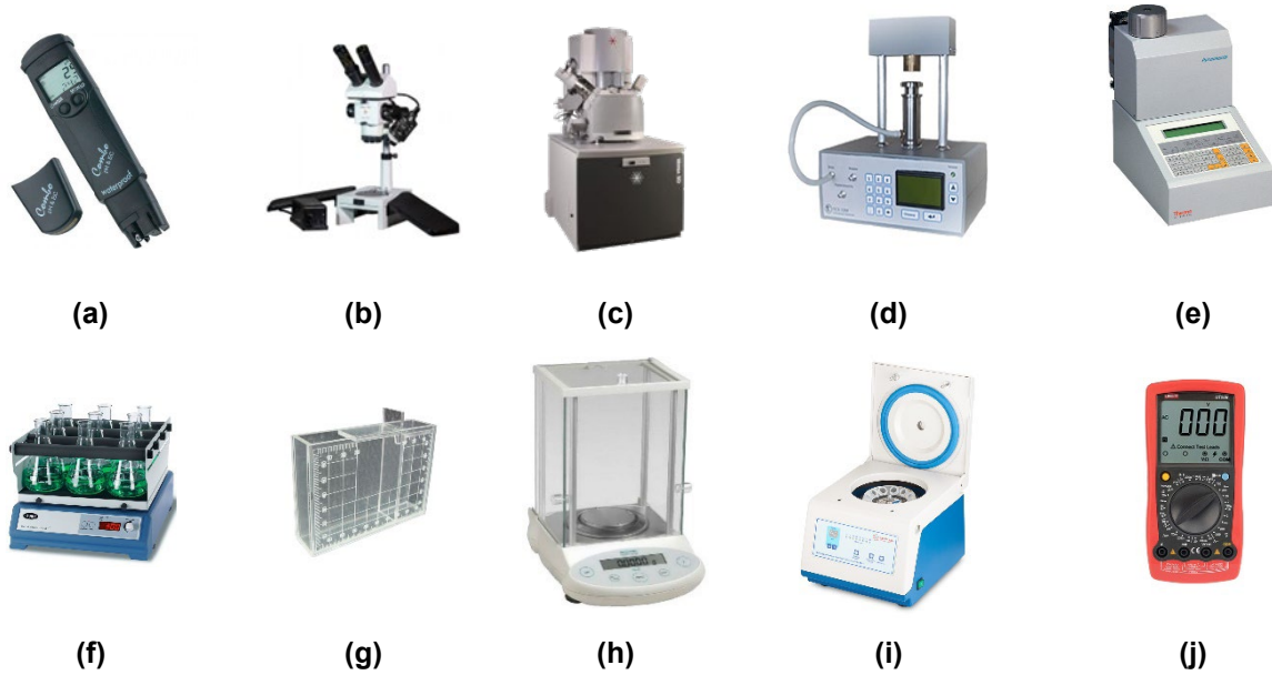
Figure 4. Devices used to determine the physico-chemical characteristics of construction dust: (a) TDS/pH-metr PH-986 analyzer by Hanna instruments (Germany); (b) MBS-10 stereoscopic microscope by LZOS (Moscow, Russia); (c) Versa 3D DualBeam electron-ion (bi-beam) microscope by FEI Company (Hillsboro, OR, USA); (d) PSKh-10 instrument by PSH (Moscow, Russia); (e) Pycnomatic Evo gas-weighing balloon by POROTEC (Germany); (f) SSL1 orbital shaker by Stual (Germany); (g) SWT-3M density analyzer by Emerging technologies corporate group (Russia); (h) ALC-80d4 digital weighing scale by Acculab (USA); (i) 80-2S sedimentator by Armed (Russia); (j) UT58B multimeter by UNI-T (China).

surcharge angle, adhesion, abrasiveness, electrical resistivity, chemical composition, hygroscopicity, and wettability. The devices used to determine the physical and chemical characteristics of construction dust are shown in Fig. 4. Table 2 shows the device specifications.