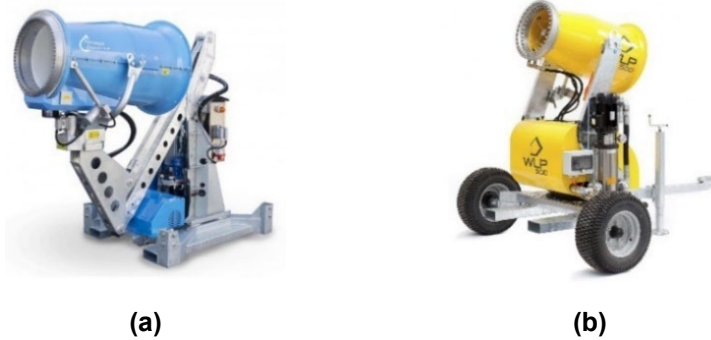
Figure 8. Dust collecting equipment for the construction site: (a) vehicle-mounted water mist cannon atomizer sprayer Fog Elefante 70 by INDROBASE (Italy); (b) WLP 500 dust suppression system by WLP (Italy).

Based on the collected information on the physical and chemical characteristics of construction dust, presented in a dust atlas, the calculation and selection of optimal dust collection equipment for a point-pattern housing development facility – an 11-storey residential complex – was carried out. Tables 2 and 3 show the initial parameters and the final calculation results. The analysis included a comparison of several installations with identical cleaning and performance indicators, shown in Fig. 8, but differing in operational characteristics and maintenance costs. The information obtained on the dust composition made it possible to adjust the calculations and optimize the choice of equipment, taking into account technical and economic factors.