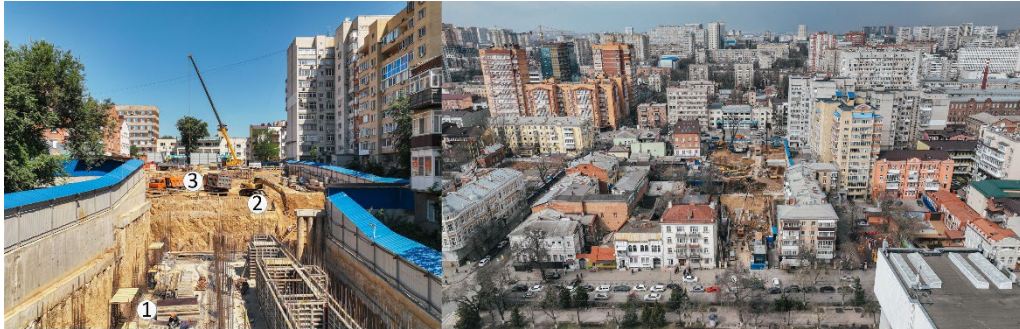
Figure 1. Schemes of the research site: 1–3 – sampling points at the construction site.

recent years, the city has experienced an unfavorable environmental situation to breathe polluted air. Air pollution is often observed at construction sites, primarily caused by emissions of inorganic dust. This dust, containing up to 70 % silicon dioxide, is found in various materials such as chamotte and cement, as well as in industrial waste. Dust with a silicon dioxide content of more than 70 % was also found in dinas. There is also an environmental threat at construction sites from suspended particles and nitrogen dioxide released during the construction process. Sources of dust emissions into the atmosphere at construction sites include: construction machinery (e.g., transportation, loading, and unloading of bulk materials); building materials (e.g., gypsum, cement, sand); and construction processes (e.g., cutting gas blocks, mixing plaster, and mortar). The construction site of the 11-floor residential building (Fig. 1) is one of the typical examples of point-pattern housing development in a megacity.