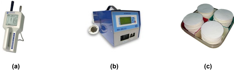
Figure 3. Devices used in sampling: (a) Handheld 3016 particle counter; (b) PU-3E/12 electric respirator; (c) AFA aerosol filters by Krezol (Voronezh, Russia).

Dust particles filtered from various zones of the construction site were mixed to form a representative sample. The excess volume of the selected material was intensively homogenized, after which it was reduced to the required amount, thereby increasing the reliability of the analysis.